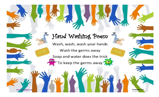
Stay Healthy and Wash Your Hands