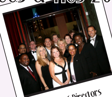
Board of Directors

On January 23 & 24, 2009, the 4C Board of Directors hosted the annual 4C Tees & Ties Fundraiser. The weekend was filled with fun and excitement with golf at Dubsread Golf Club and lively music at BB King's Blues Club in Orlando, Florida. The event raised over $53,000 for direct support of child care financial assistance through the School Readiness Program for low income families.