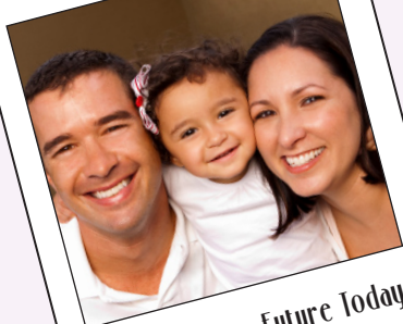
Caring for Our Future Today

“ You have been a great help and I am not as stressed out as before wondering how I could pay for child care with all of my other bills. ”